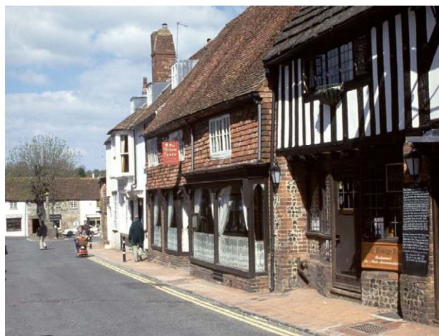
Alfriston, East Sussex