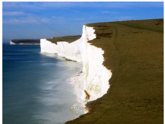
Seven Sisters, East Sussex