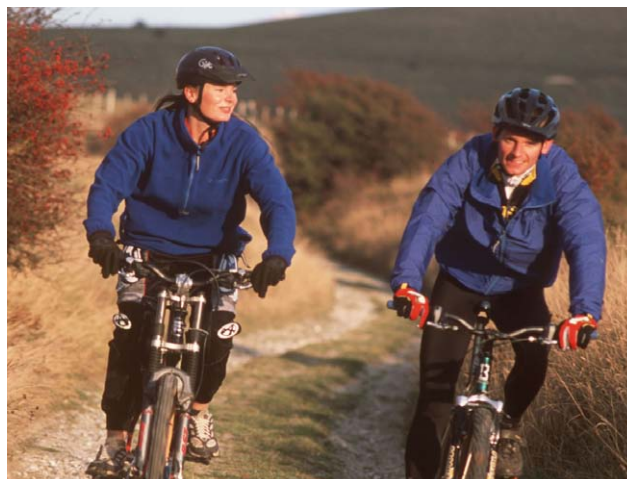
Cycling on the South Downs Way

The variety of landscapes, wildlife and culture provides rich opportunities for learning about the South Downs as a special place, for the many school and college students and lifelong learners. Museums, churches, historic houses, outdoor education centres and wildlife reserves are places that provide both enjoyment and learning. There is a strong volunteering tradition providing chances for outdoor conservation work, acquiring rural skills, leading guided walks and carrying out survey work relating to wildlife species and rights of way.