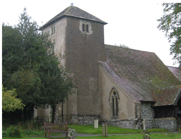
Saxon Church, Singleton, West Sussex