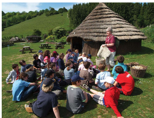
Butser Ancient Farm, Chalton, Hampshire