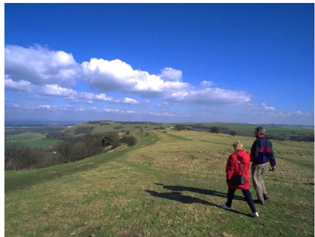
Walkers on the South Downs Way, Devil's Dyke