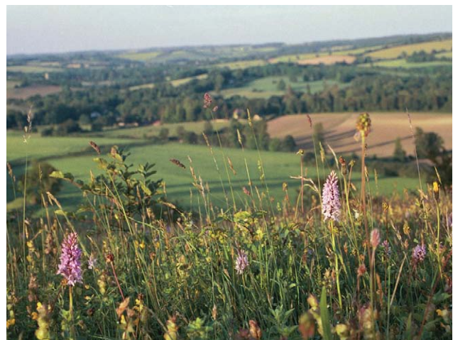
Orchids on Beacon Hill, Hampshire