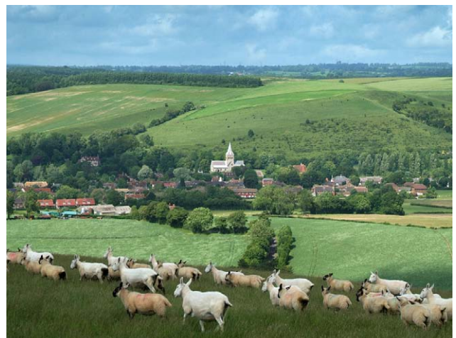
Sheep in the Meon Valley, Hampshire