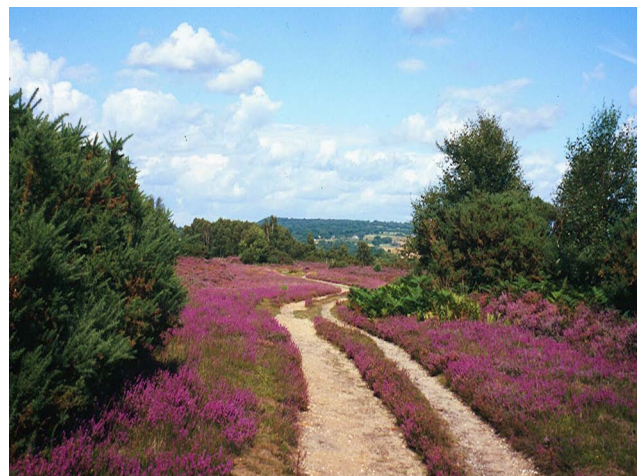
Heathland habitat, Iping Common, West Sussex