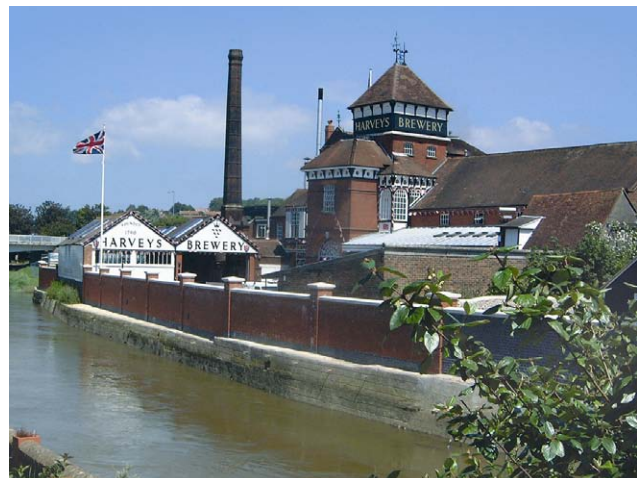
Harveys Brewery, Lewes, East Sussex