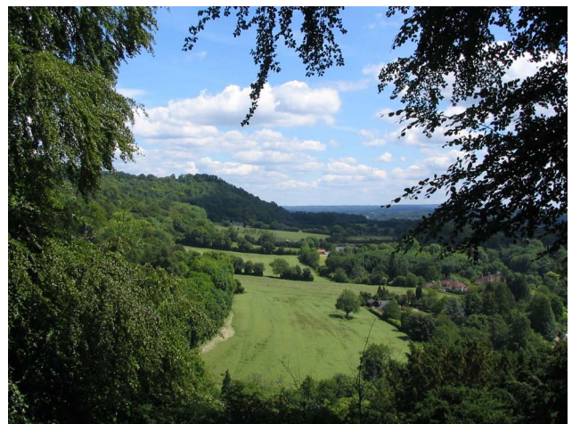
The Hangers from Stoner Hill, Hampshire