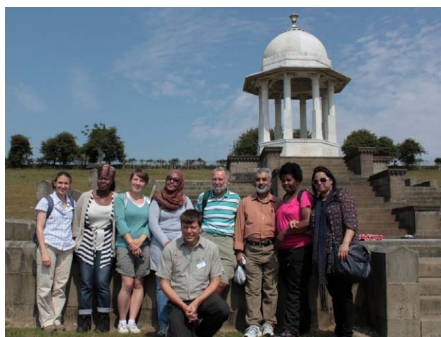
The Chattri, above Brighton, East Sussex