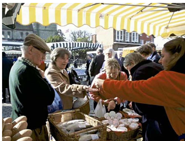
Farmers' Market, Petersfield, Hampshire