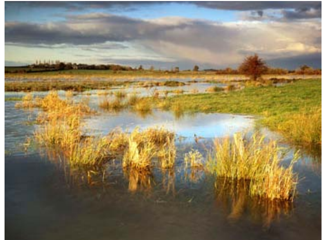
Amberley Wildbrooks, West Sussex

The South Downs National Park is in South East England, one of the most crowded parts of the United Kingdom. Although its most popular locations are heavily visited, many people greatly value the sense of tranquillity and unspoilt places which give them a feeling of peace and space. In some areas the landscape seems to possess a timeless quality, largely lacking intrusive development and retaining areas of dark night skies. This is a place where people seek to escape from the hustle and bustle in this busy part of England, to relax, unwind and re-charge their batteries.