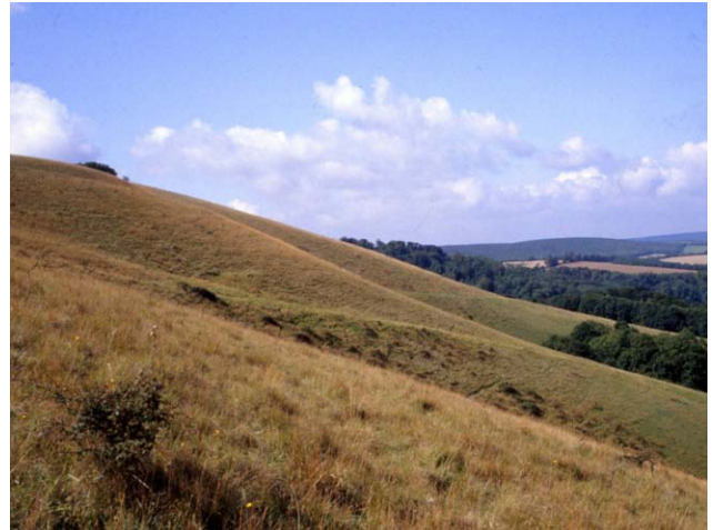
Harting Down, West Sussex

There are stunning, panoramic views to the sea and across the Weald as you travel the hundred mile length of the South Downs Way from Winchester to Eastbourne, culminating in the impressive chalk cliffs at Seven Sisters. From near and far, the South Downs is an area of inspirational beauty that can lift the soul.