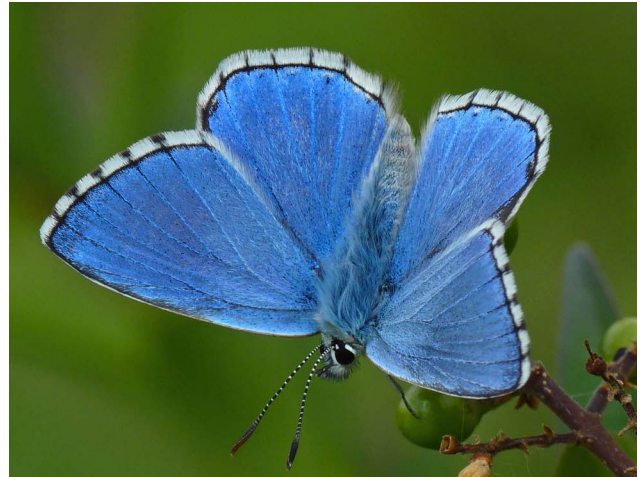
Adonis blue butterfly

The river valleys intersecting the South Downs support wetland habitats and a wealth of birdlife, notably at Pulborough Brooks. Many fish, amphibians and invertebrates thrive in the clear chalk streams of the Meon and Itchen in Hampshire where elusive wild mammals such as otter and water vole may also be spotted. The extensive chalk sea cliffs and shoreline in the East host a wide range of coastal wildlife including breeding colonies of seabirds such as kittiwakes and fulmars.