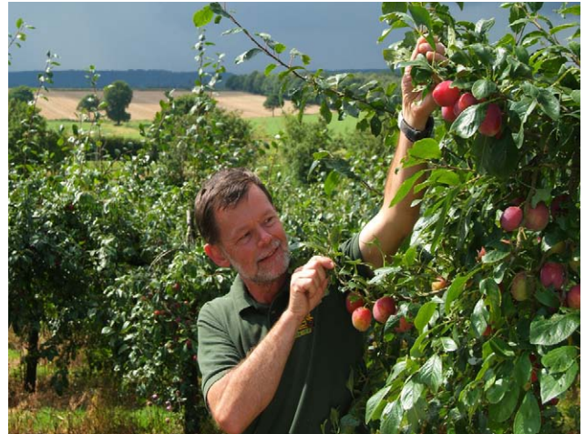
Durleighmarsh Farm & Orchard, West Sussex

However, the economy of the National Park is by no means restricted to farming. There are many popular tourist attractions and well-loved local pubs which give character to our towns and villages. The National Park is also home to a wide range of other businesses, for example new technology and science, which supports local employment.