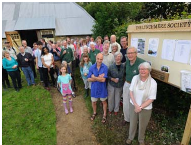
The Lynchmere Society, West Sussex

Many of these settlements contain strong and vibrant communities with much invested in the future of where they live, and a sense of identity with their local area, its culture and history. Across the South Downs there are also communities of people who come together through common interests, for example, farming, conservation and recreation. These communities dedicate time and resources to enhancing community life, conserving what is important to them and planning for future generations.