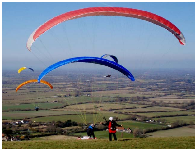
Paragliding near Lewes